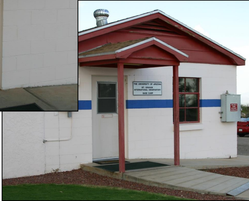
Exterior Lock Box