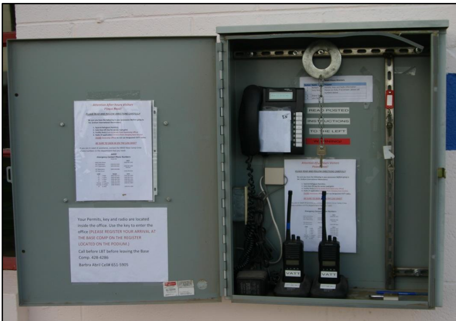
Lock box open – Phone and Facility Key